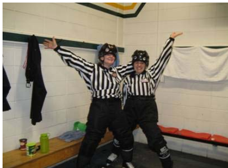
Two of our finest looking their pre-game best.