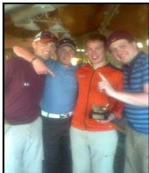
2007 Champs. Remember it's not a gimme if you're still away.